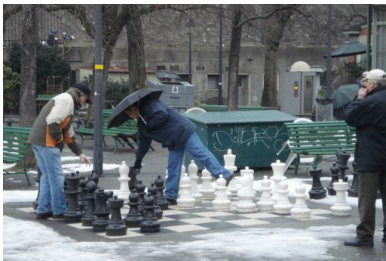
Street Chess in Old Geneva