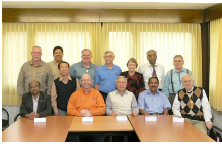
Mid Year Meeting attendees