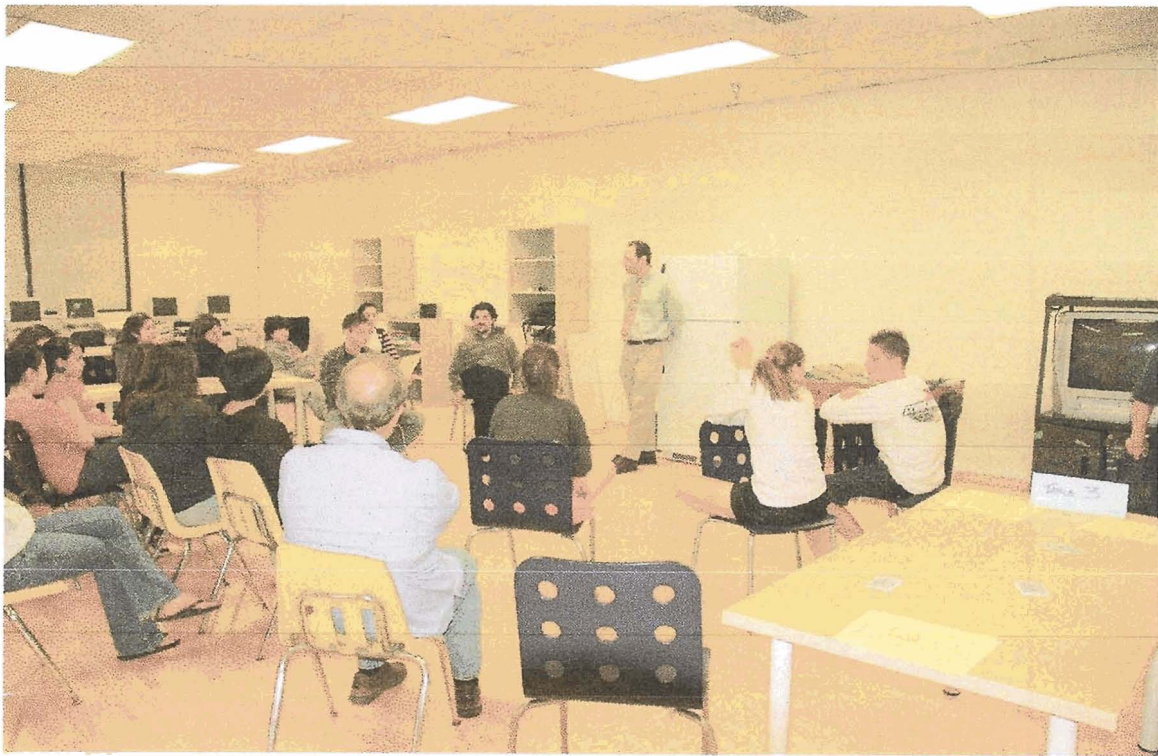
YOUTH AND GOVERNMENT OPEN HOUSE

They use the same facilities that our California government uses so this gives a very important atmosphere for all involved. Our Y's Men's service club provides a grant each year for $1000 to assist them financially. We get a good report each year from many of the members coming to our meeting.