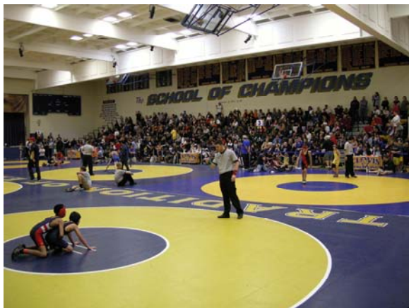
Participants and spectators