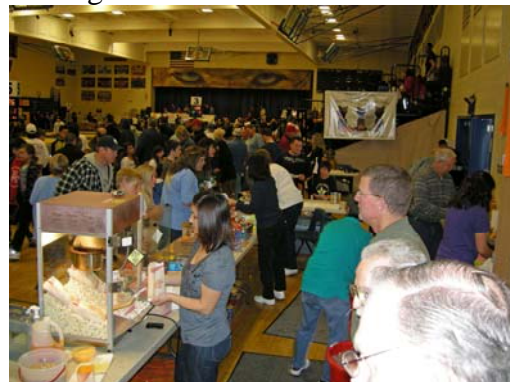
Working the concession stand