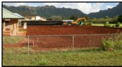
PHOTOS DEPICT FOUNDATION CONSTRUCTION FOR OLYMPIC-SIZE SWIMMING POOL.