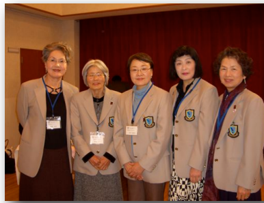
Here is a photo of five Mennettes then.

Wakayama YMCA celebrated their 30th anniversary on November 24th. I attended to help small things such as preparing tables and serving dishes with other Mennettes.