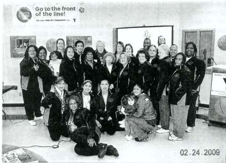
Campaign workers who qualified as "GOAL BUSTERS" Feb 24, 2009