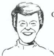
OUR PREZ SEZ