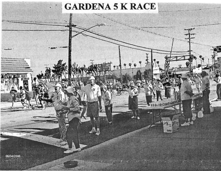
Some of the members working the water station.