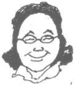
Our Prez Says