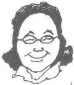
Our Prez Says