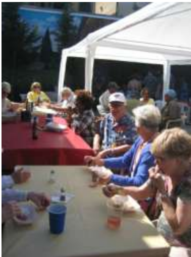
Henry's Fish Fry