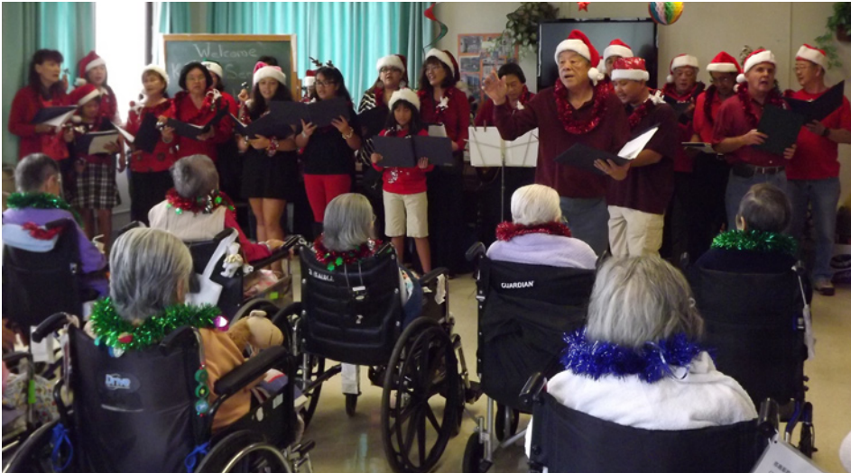
Kalihi Y's Men and Women family members and friends bring yule tide cheer to Maluhia Hospital patients.