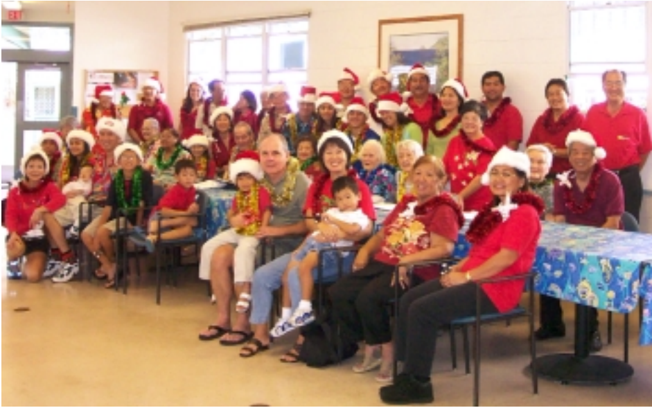
Carolers and residents of Maluhia Senior Home pose after singing Christmas carols.