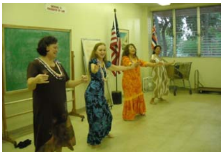
Tina's Hula Troupe for entertainment