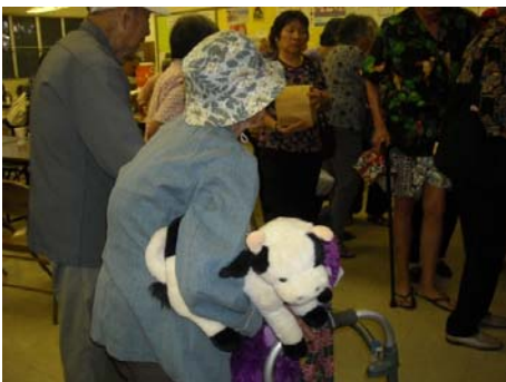
100 year old senior gets her Stuffed Animal