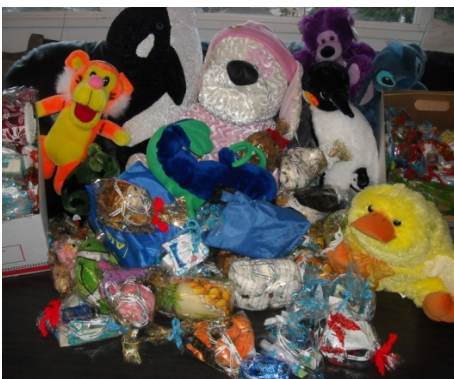
Gift wrapped items & stuffed animals for seniors