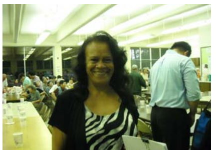
VP of Kalanihuiua Association