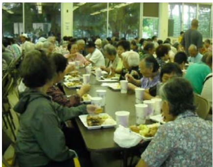
Seniors served their dinner