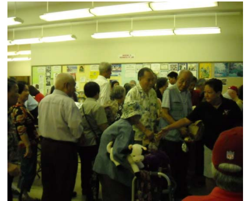
Seniors are given their goodie bags