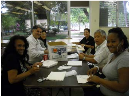
Members folding napkins